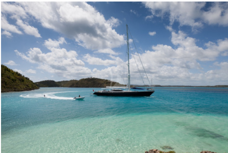
GENEVIEVE At anchor