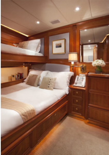
GENEVIEVE Double cabin with built in upper bunk