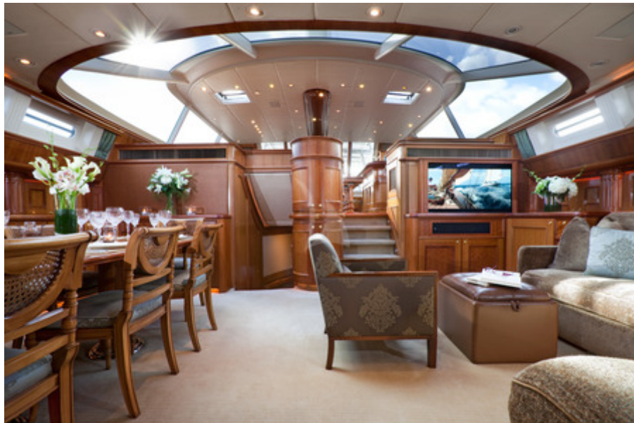
GENEVIEVE Upper saloon