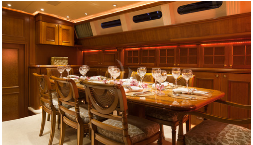
GENEVIEVE Interior dining