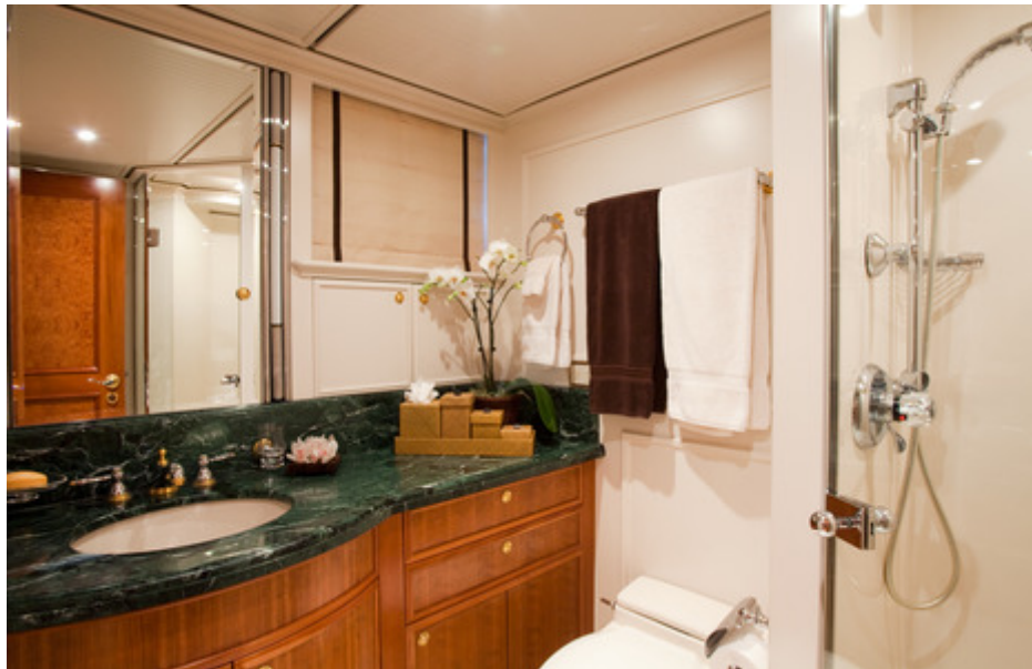
GENEVIEVE Guest en suite