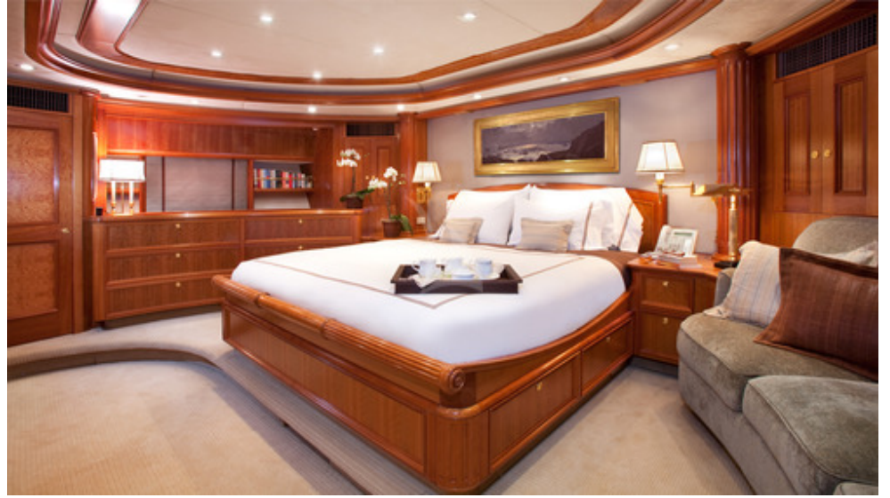
GENEVIEVE Full beam master cabin