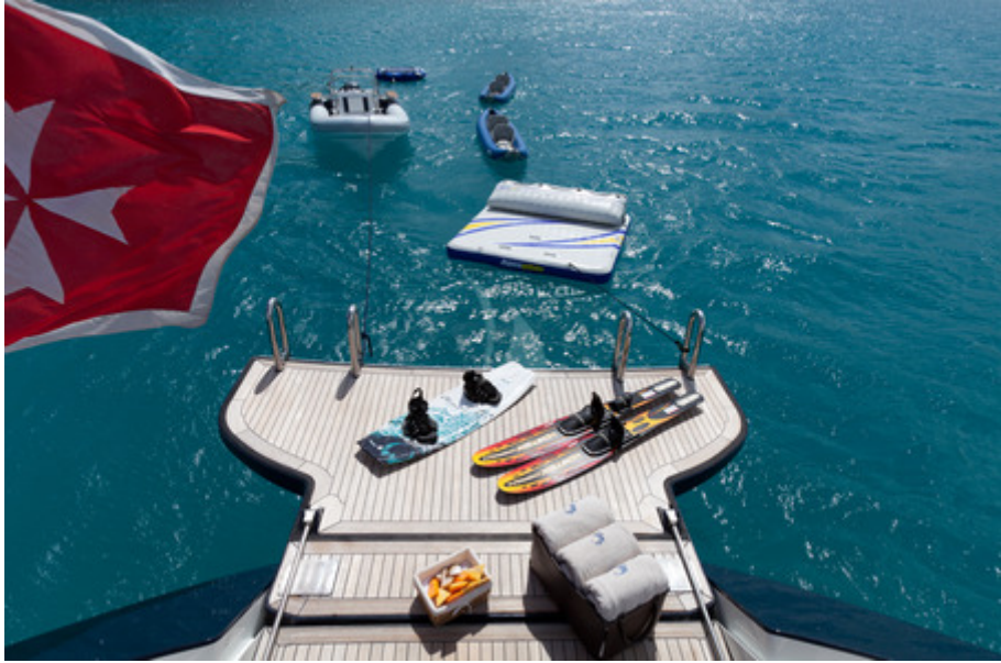
Swim platform with tender