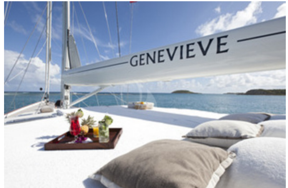
GENEVIEVE Sunpads under the boom