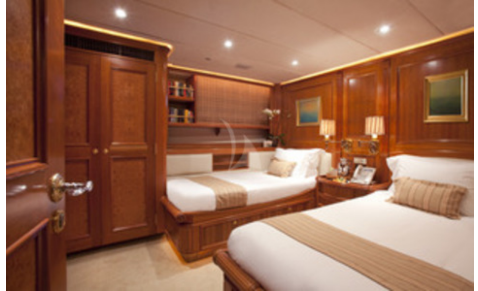
GENEVIEVE Twin cabin