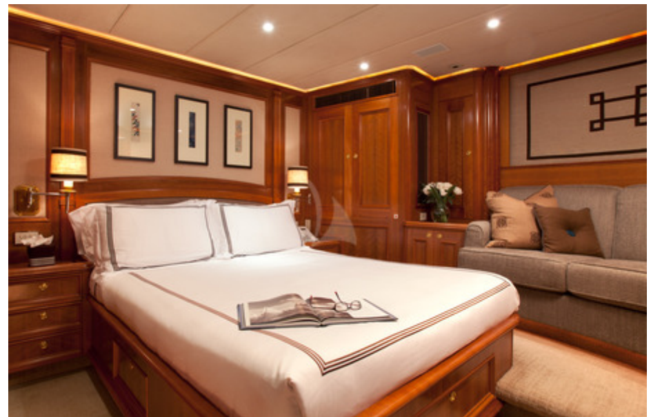
GENEVIEVE VIP cabin