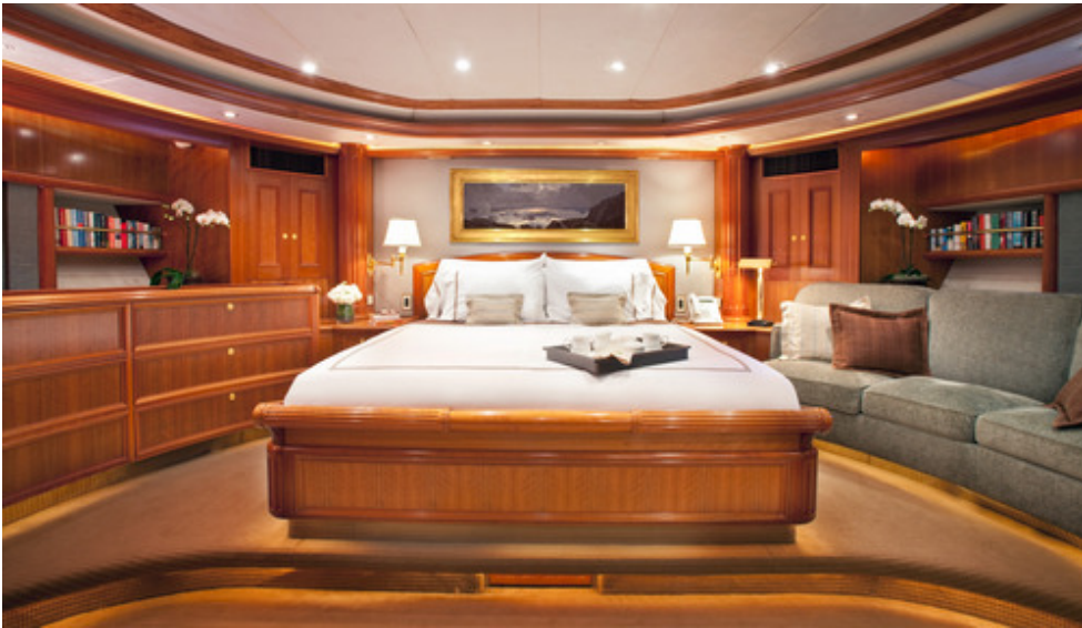
GENEVIEVE Full beam master cabin