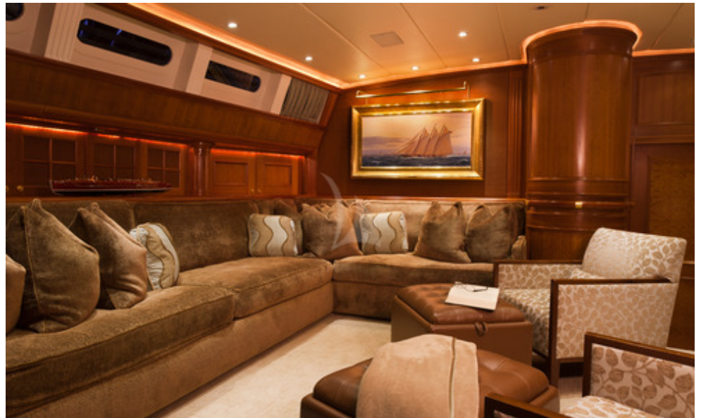
GENEVIEVE Lower saloon lounge area