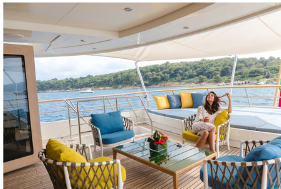
Upper Deck Lounge