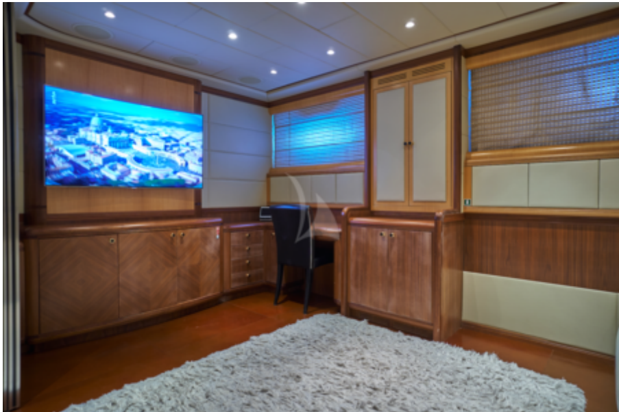
Lower Deck Living Space