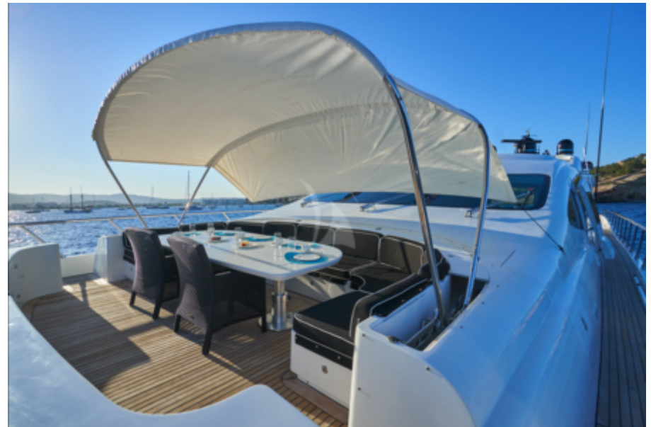
Foredeck Alfresco Area