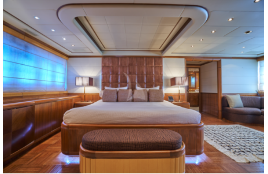
Master Cabin picture 1