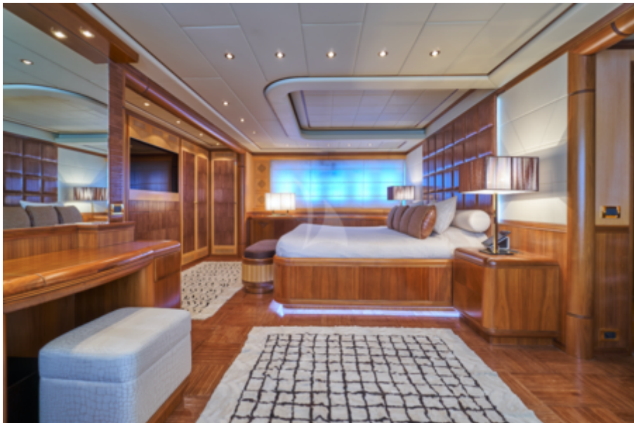
Master Cabin picture 2