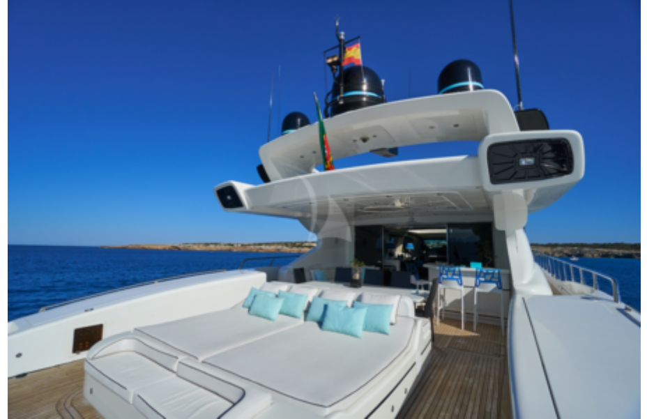
Aft Deck Sunbath 1