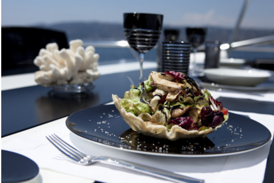
SHANE - Sample dish