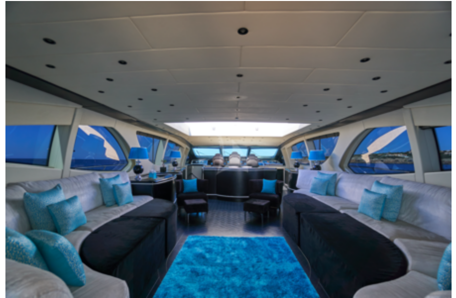
Living Room picture 2