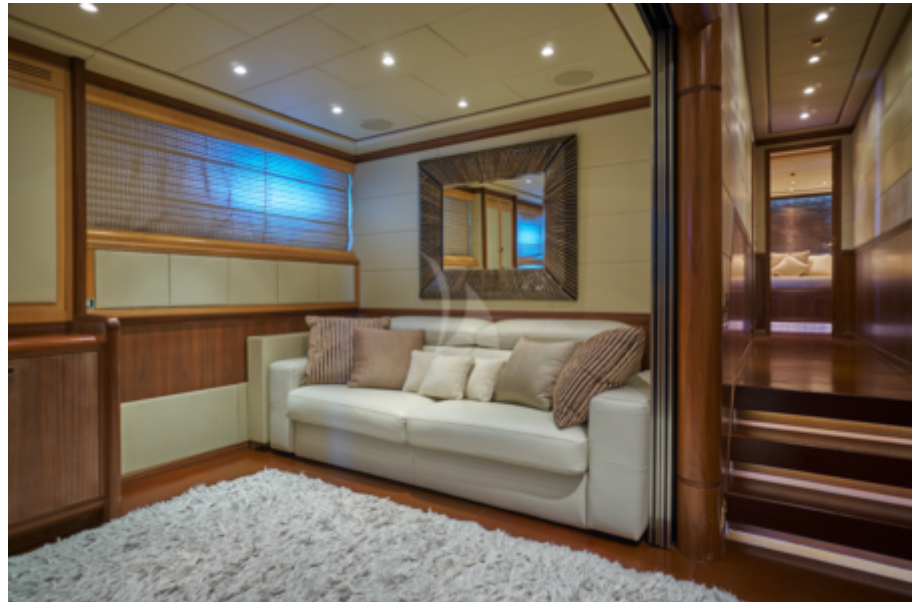
Lower Deck Living Space convertible to Double Bed