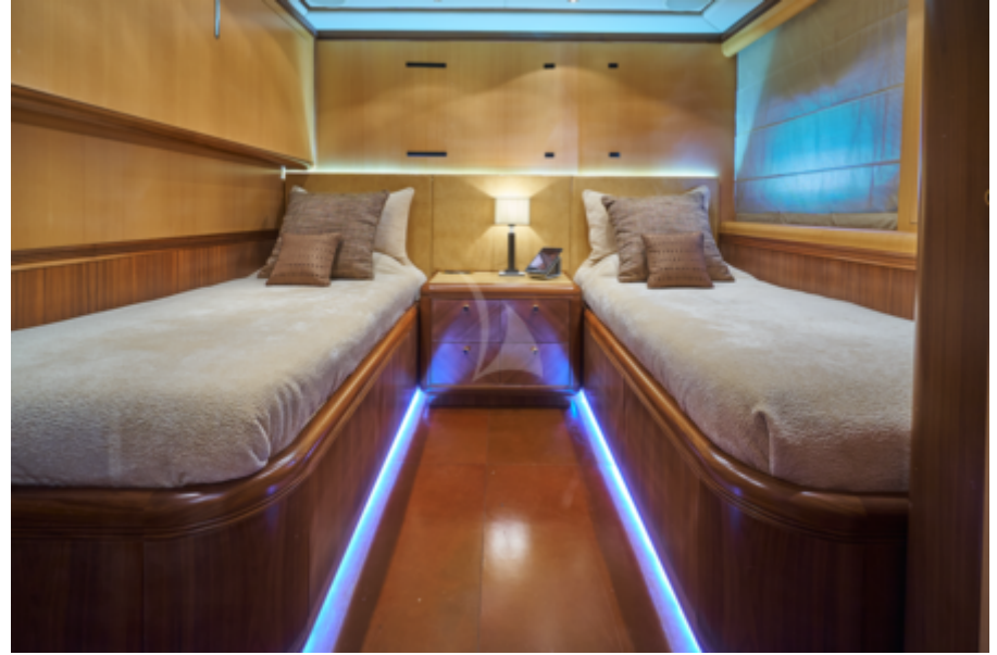
Twin Cabin with Pullman