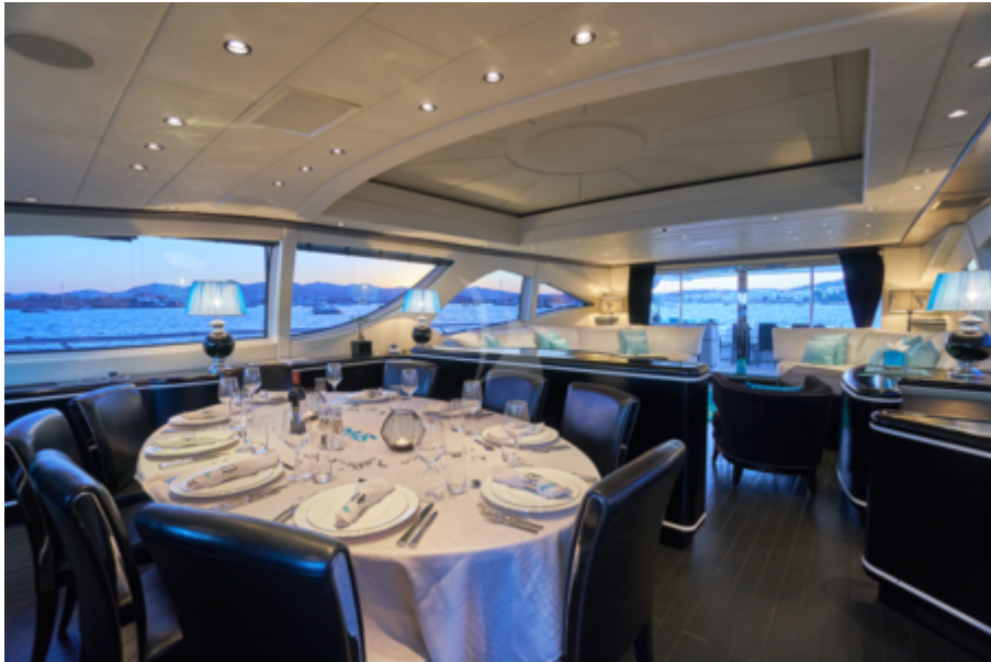
Living Room picture 1