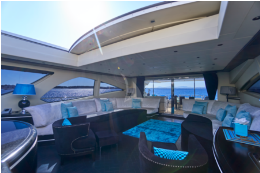
Living Room with Open Hard Top 1