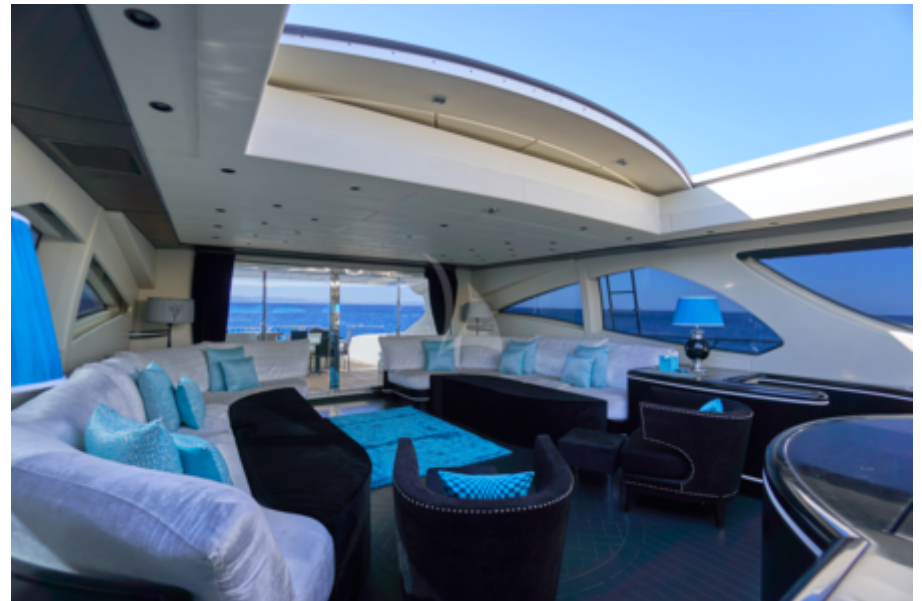
Living Room with Open Hard Top 2